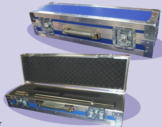
Case dimensions (Ext): (W) 200mm (L) 680mm (H) 120mm

This is ideal for clients who may wish to ship just the camera without the remainder of the camera equipment.